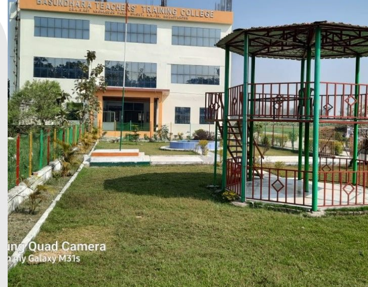
ing Quad Camera 2 my Galaxy M31s